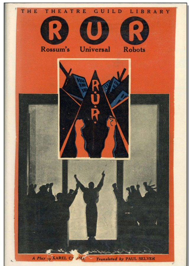
In Karel Čapek's sci-fi play "R.U.R. – Rossum's Universal Robots" – published in 1920 – the robots are first human helpers and finally destroy the human race.

As such, in January 2021, the US Defense Department published a strategy for countering small unmanned aircraft systems 4 that expresses alarm at the changing nature of war and the growing competition, both of which pose challenges to American superiority.