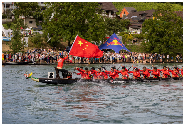
Chinese team at the dragon boat race in Eglisau, June 2024.

It is a pleasure to get to know different histories, cultures, traditions, living environments and lifestyles. At the same time, I have found that the Swiss and the Chinese share many characteristics, such as being very hardworking, valuing honesty and sincerity, and placing a high value on family and friends. These impressions of me are shared by many Swiss friends. It gives me