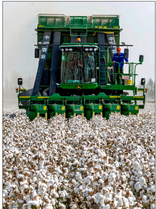
Modern cotton harvester in use. (Picture ma)

The plenary session also conveyed to the world China’s clear position of deepening reforms and advocating an open world economy,