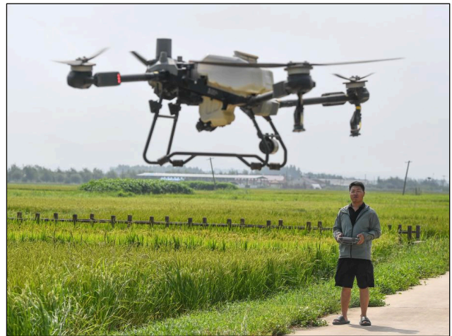
Agricultural innovations.

China and Switzerland have strong economic complementarities and a broad scope for cooperation, with huge potential for both in traditional and emerging industries, such as the green economy, the digital economy, life sciences and other areas. China continues to promote high-quality development and a high level of opening to the outside world, offering foreign companies numerous opportunities for cooperation and development, as well as a streamlined, transparent and predictable business environment for investment and operations. We welcome Swiss companies to seize the "China opportunity".