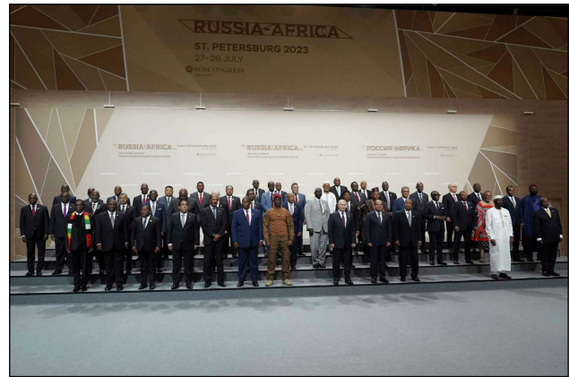
Russia-Africa Summit from 27 to 30 July 2023. 49 of the 54 countries of the African continent were represented in St. Petersburg.

We have always supported the constructive initiatives of our partners. We stand for granting African countries their rightful place in the struc-